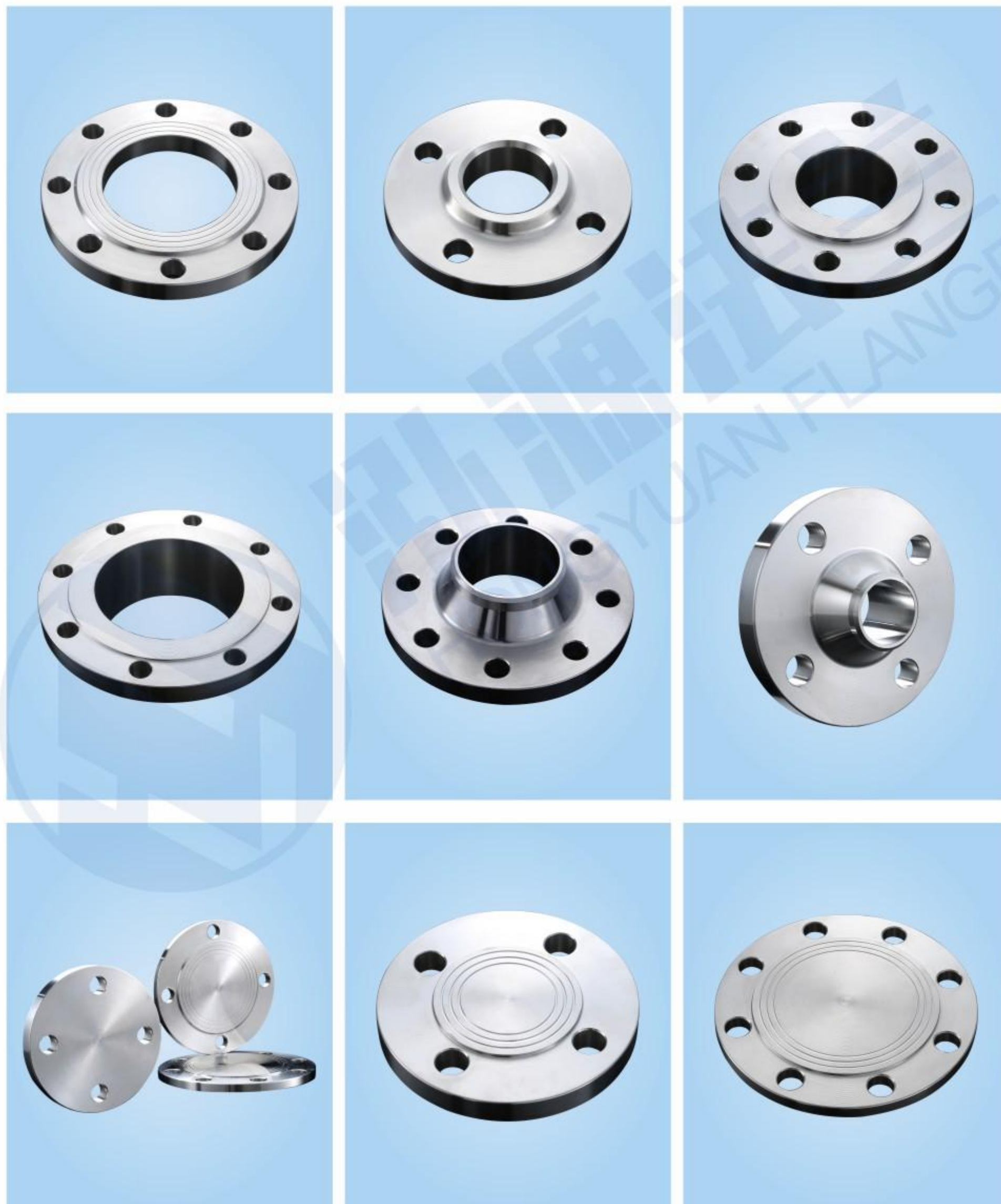
常规法兰系列 ▼ Conventional flange series